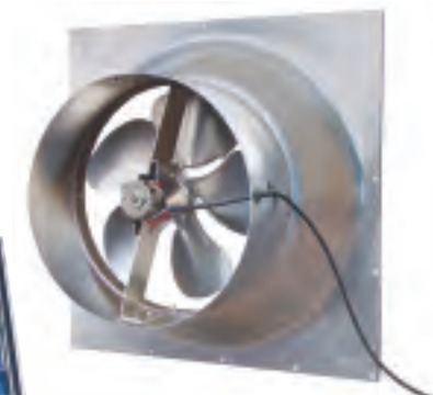
GABLE-MOUNTED UNIT 10 OR 20 WATT

As the exhaust travels through the vent it can build up pressure within, making it work less effectively. Natural Light's design minimizes obstructions in the flashing and shroud and incorporates an angled throat to facilitate a venturi effect or suction effect to increase air flow. This improvement increases cfm output and also reduces wear on the motor!