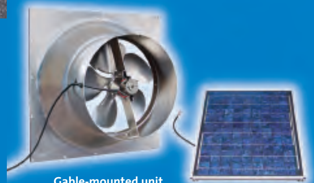
Gable-mounted unit (10 or 20 watt)