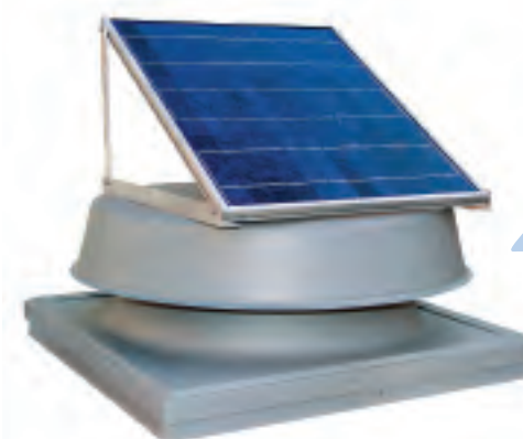
CURB-MOUNTED COMMERCIAL UNIT

Other fans incorporate the solar panel into the fan housing, leaving you to compromise between optimal venting and optimal solar exposure. Natural Light's solar panel is fitted with an exclusive bracket allowing you to mount the panel at the best collection angle and position, either on the fan housing or directly on the roof. With Natural Light , you can place your vent where you need it most and your panel where it will work the best.