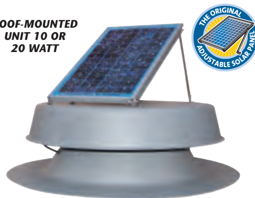
ROOF-MOUNTED UNIT 10 OR 20 WATT

Excess moisture trapped in your attic can cause a variety of problems from rust and rot to increased bacteria and mold counts which can have a direct impact on your respiratory health! Passive vents have been a part of building codes for years but to really get the benefit of venting, soffit vents, ridges vents and louvers rely on nature to provide sufficient air pressure and air movement. So the majority of the time your attic is stagnant and continues to build up heat and moisture.