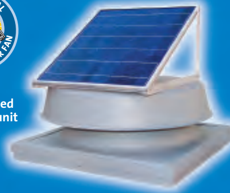
Curb-mounted commercial unit (20 watt)