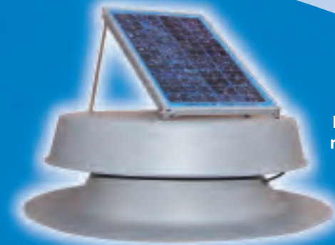
Roof-mounted residential unit (10 or 20 watt)

At Natural Light, our mission is to improve your quality of life while protecting the environment. Through stringent attention to design, function and construction, we believe our Solar Attic Fan and Tubular Skylights achieve our mission while delivering superior products. For more information about solar attic venting, solar day lighting and other energy saving ideas, please contact an authorized dealer or visit our web site at www.solaratticfan.com